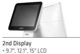
2nd Display • 9.7", 12.1", 15" LCD