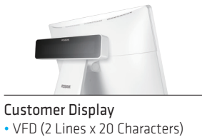
Customer Display • VFD (2 Lines x 20 Characters)