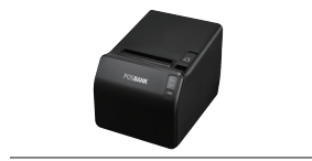
POS Printers • A7, A11