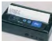
Wide 112mm Paper Width

Wide, 104mm output for data filled service reports, delivery notes or law enforcement parking or motoring tickets in a compact case