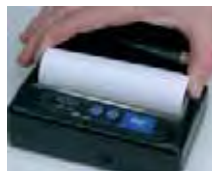
Easy Paper Loading