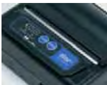
Magnetic Stripe Reader with Serial & Bluetooth

Pocket size 80mm workhorse with an extended battery life of 10 hours with Bluetooth for wireless communication and Serial for printer settings and set-up