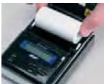
Easy Paper Loading