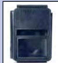
Carrying Case for SM-S200