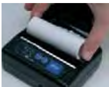
Easy Paper Loading