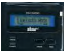
Blue Light Display

Sophisticated pocket size printer capable of producing high quality output at a fast 80mm/sec. with Bluetooth and Serial connections as well as a cover open sensor and power save facility