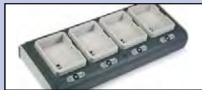
4-Bay Battery Charger