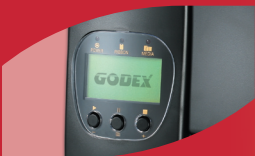
Upgraded Graphic LCD