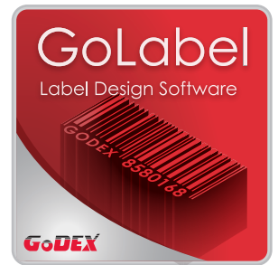
Free labeling software GoLabel for easy printing