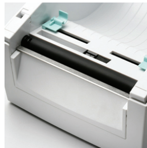
Auto language emulations: GEPL, GZPL